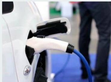
Plus selected vocational qualifications